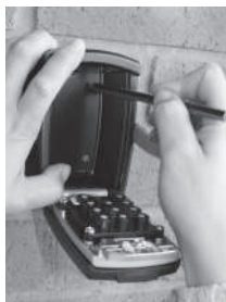
Using the pencil mark the position of the screw holes to be drilled